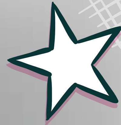
Wise Men Follow a Star