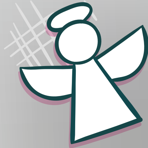
The Angel and Mary