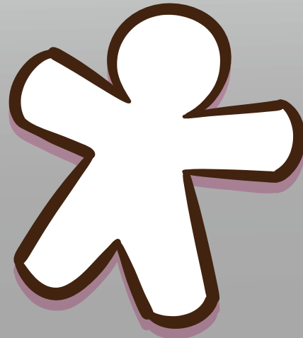
Jesus Is Born